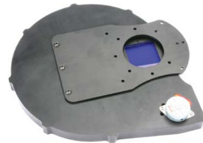
AFW50-7S Filter wheel with adapter plate

For complete CCD specifications, including cosmetic grading, see data sheet from manufacturer.